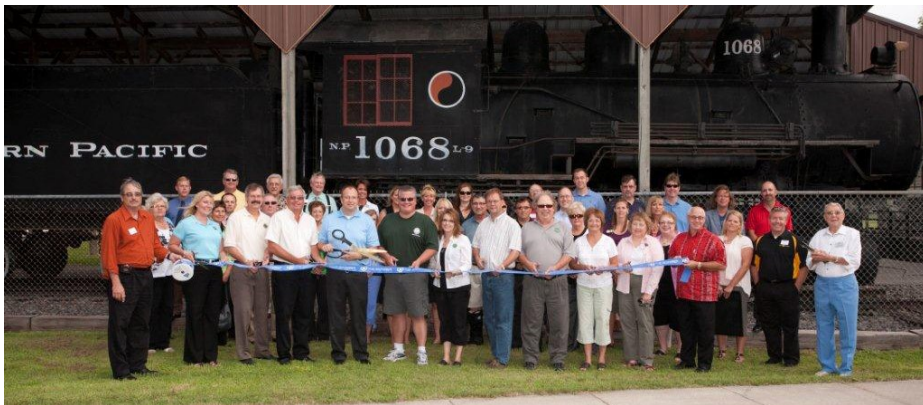
City of Dilworth Celebrates 100 Years